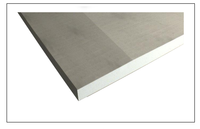
Manufacturer address: Bålsta plant at Kalmarleden 50, 746 24 Bålsta, Sweden